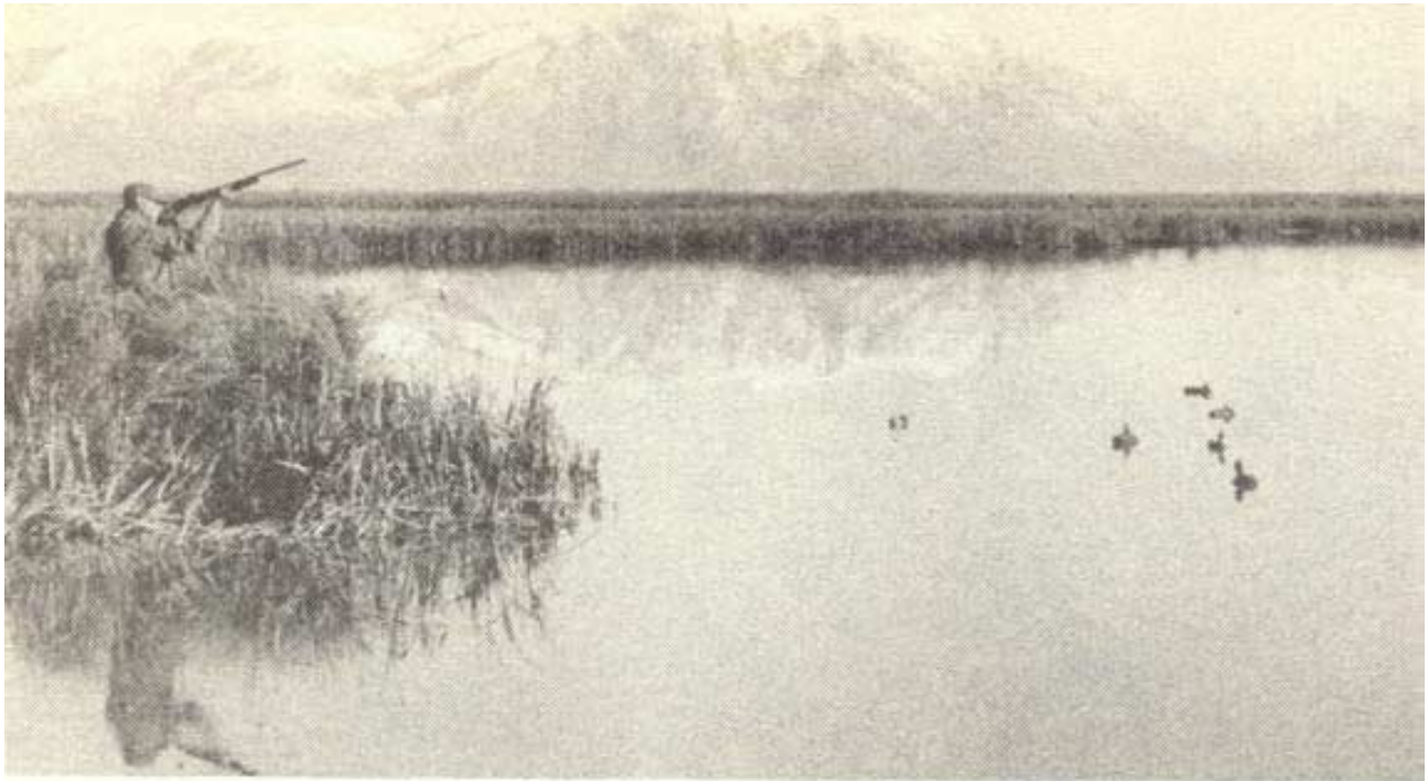
A hunter's paradise in the Bear River marshes of Utah