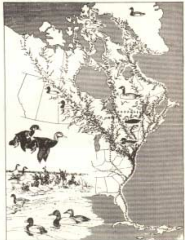
The air lanes followed by our migrating waterfowl. Upper left: Pacific Flyway. Upper right: Central Flyway. Lower left: Mississippi Flyway. Lower right: Atlantic Flyway